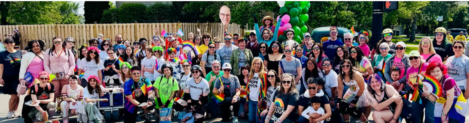
2025 Buffalo Grove Pinta Pride Parade

At Glen's Friends, we wholeheartedly embrace the transformative power of love, determined to cultivate a world where every soul can experience the boundless joy of loving and being loved.